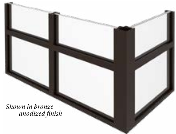
Shown in bronze anodized finish