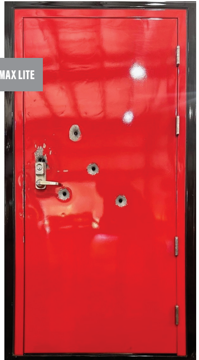
SDR MAX LITE